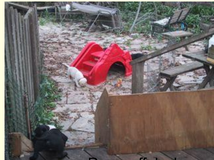
Ramp off deck