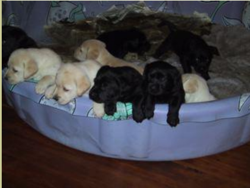
Ready for Bigger space