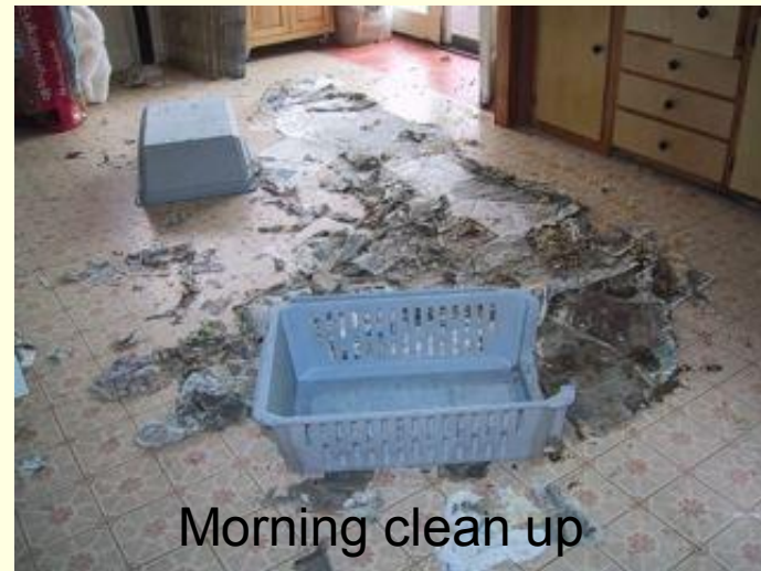
Morning clean up