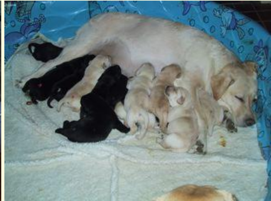
14 may need bigger space sooner